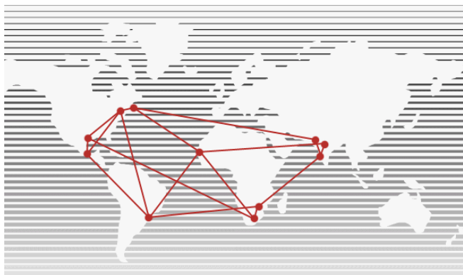
Networks: Discovering Shared Meaning and Purpose

networks and now, networks of networks. These networks are essential for people finding like-minded others, the first stage in the lifecycle of emergence. It's important to note that networks are only the beginning. They are based on self-interest--people usually network together for their own