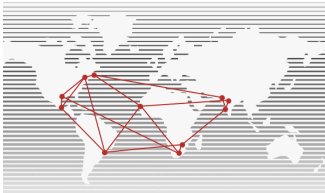
Networks: Discovering Shared Meaning and Purpose

networks and now, networks of networks. These networks are essential for people finding like-minded others, the first stage in the lifecycle of emergence. It's important to note that networks are only the beginning. They are based on self-interest--people usually network together for their own